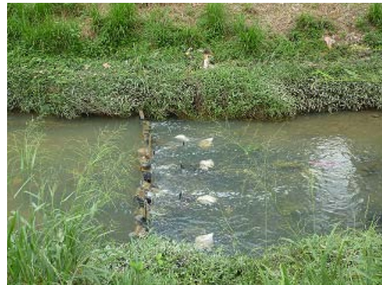
Retention treatment area allows more time for the biocatalysts to break down pollutants