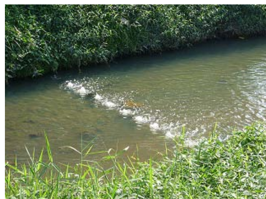
Air blowers create more oxygen for the biocatalysts to digest waste