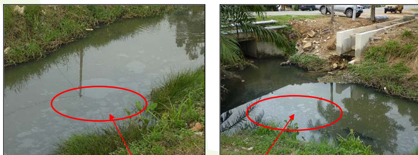
Oil and grease contamination on the river's surface

In an effort to improve the water quality in the river, FastTrack Resources carried out a validation program using BiOWiSH™-Aqua FOG. FastTrack used BiOWiSH™-Aqua FOG to enhance the oxidative capacity of the river system's existing biology. For the trial they filled small bags with BiOWiSH™-Aqua FOG and hung them from wooden sticks in the river. FastTrack measured oil and grease levels, Ammonia Nitrogen (NH 3 -N) levels and DO levels at both the inlet and outlet points before treatment began and again every two weeks during the treatment period. All indicators, including aesthetics, showed improvements during the testing period.